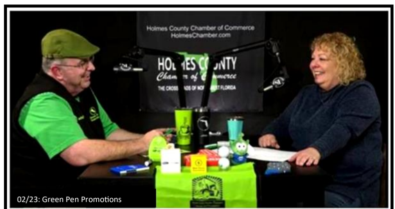
'Chats with the Chamber Lady' Podcast by Southern Lights Productions