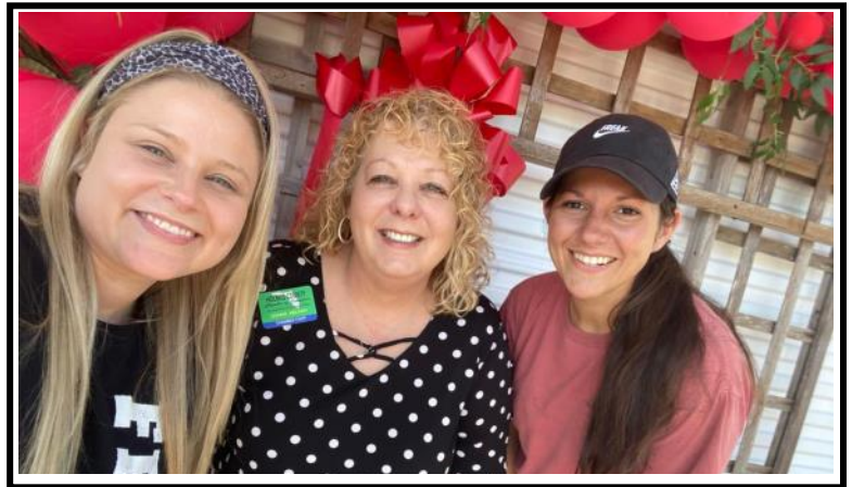
Networking: Pepper Town Market