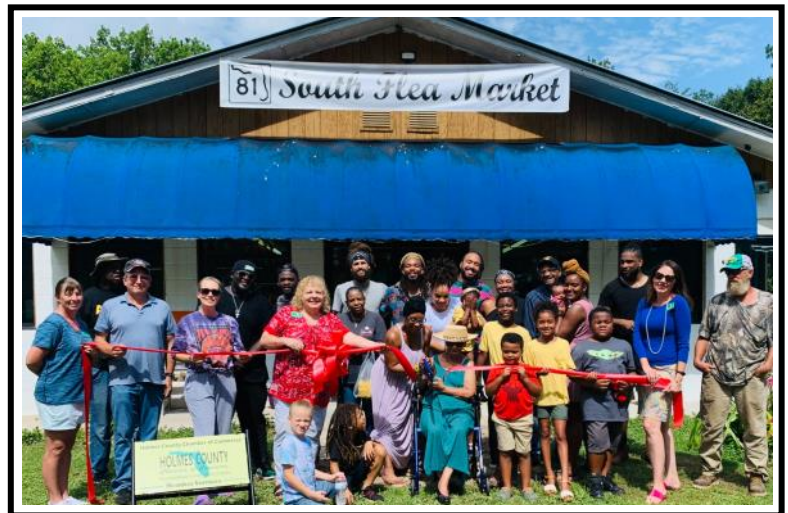
Ribbon Cutting: 81 South Flea Market